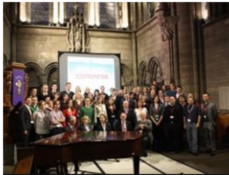
III Congress, Glasgow 2010