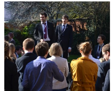
Democracy in action — presentation of the Congress host candidates before the elections

The Congress has had extensive media coverage. Apart from local media, e.g. university radio and television, we are in contact with Polish newspapers. Due to the high profile of keynote speakers, each year the Congress is mentioned in Polish TV news bulletins that can reach millions of viewers.