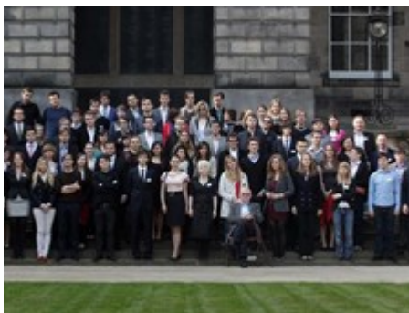
V Congress, Edinburgh 2012