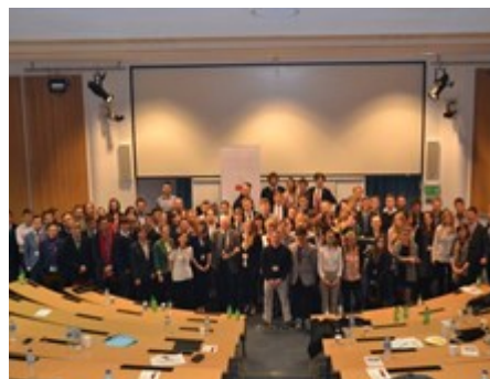
VI Congress, Warwick 2013