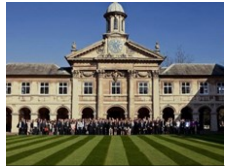
IV Congress, Cambridge 2011