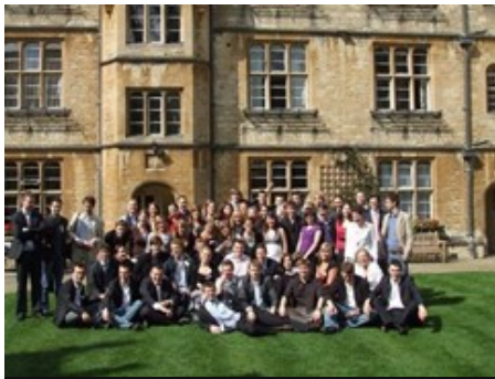
I Congress, Oxford 2008