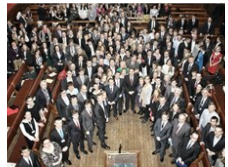
VII Congress, Oxford 2014