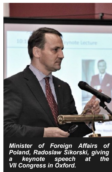
Minister of Foreign Affairs of Poland, Radosław Sikorski, giving a keynote speech at the VII Congress in Oxford.

The overarching theme of the Congress will be "European leaders – facing global challenges". We wish to evaluate the issues of European security, future of the European Union, demographic challenges to the economy, as well as role of science and innovation. We would like the guest of the Congress, being leading authorities in different areas of public life, to pass on valuable knowledge to the delegates — the leaders of the future.