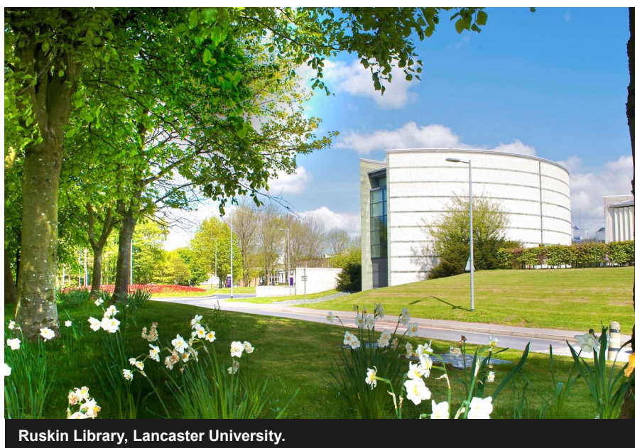
Ruskin Library, Lancaster University.