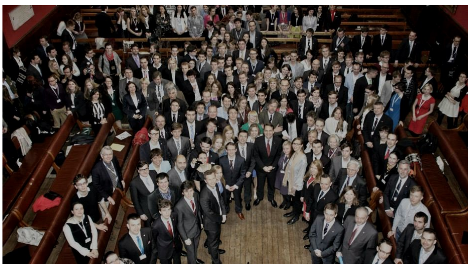
Group photo of participants of the VII Congress in Oxford.

Since its launch in 2007, the annual Congress has in turn been hosted by students at the universities of Oxford (2008, 2014), London (2009), Glasgow (2010), Cambridge (2011), Edinburgh (2012), Warwick (2013). The Congress has been organised under the indispensable patronage of institutions such as the Office of the President of Poland, the European Commission, and the Polish Ministry of Foreign Affairs.