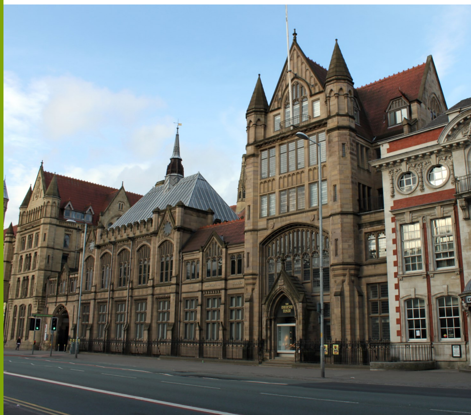
University of Manchester